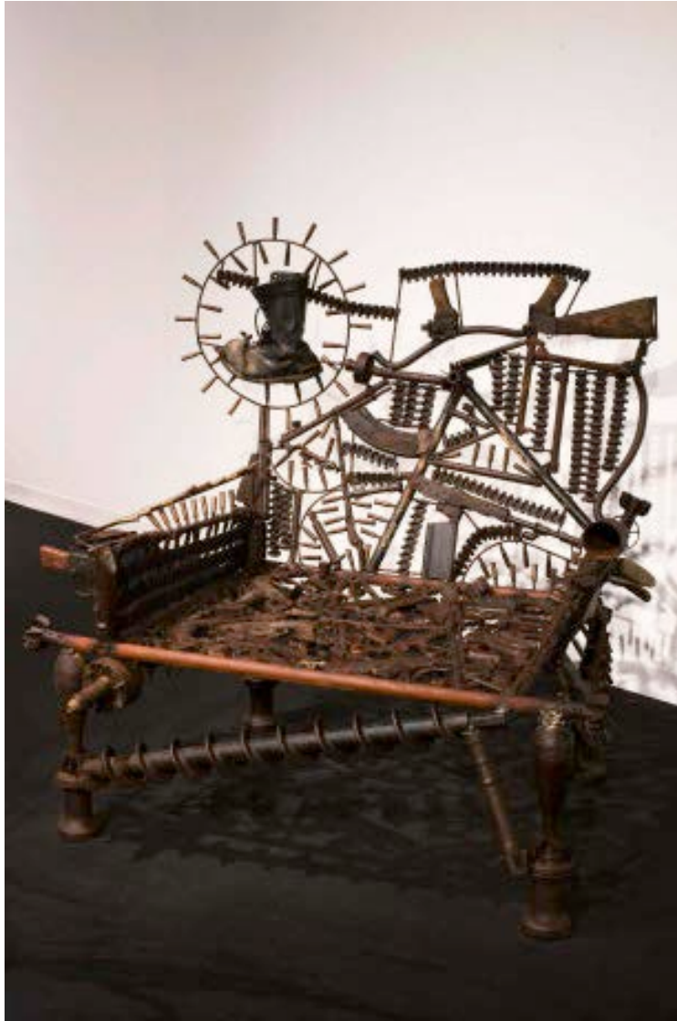
Gonçalo Mabunda, The Hope Throne (2008)