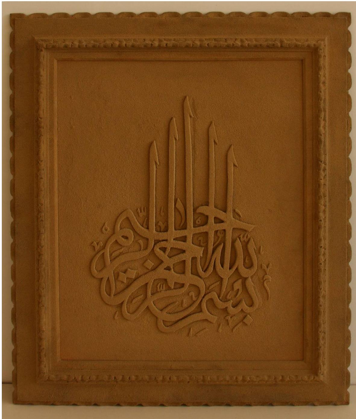
Sasha Meret Sand Calligraphy , 2010 Still from video Wood, foam core, sand, and glue